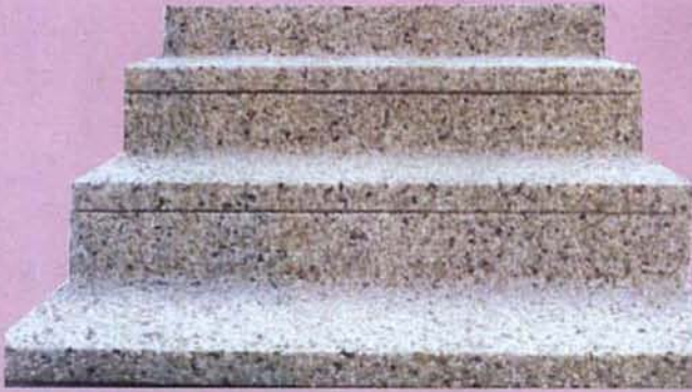
COMPOSED MATERIAL PIECES