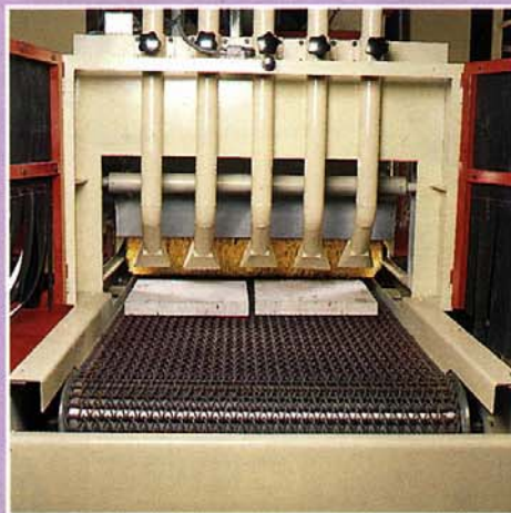
OUTLET AND BLOWING